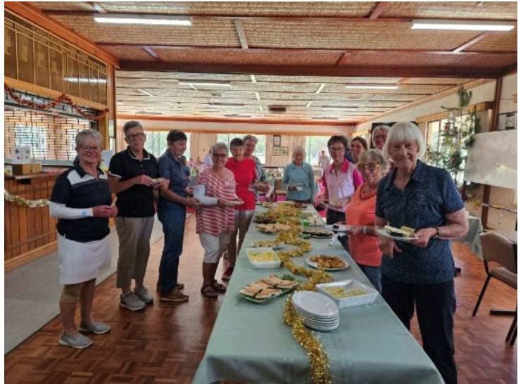
The ladies enjoyed a delicious luncheon to celebrate the end of 2025 after playing a drop out Ambrose with only three clubs in their bag.